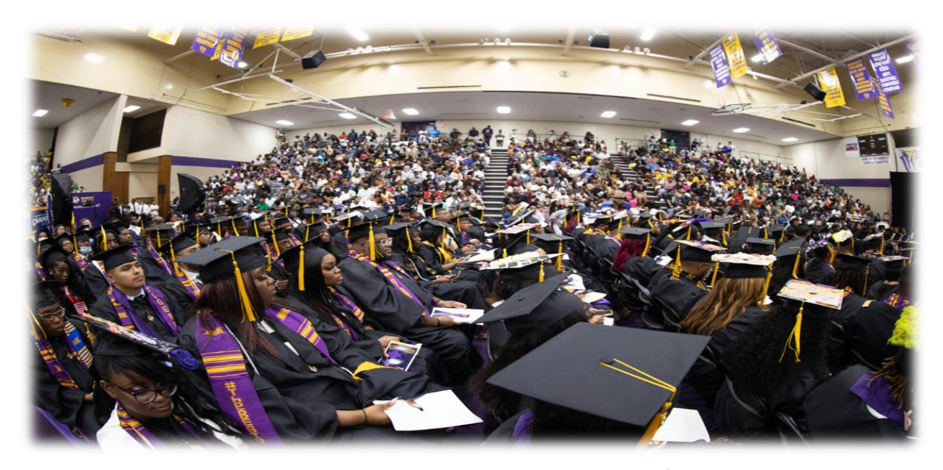
Benedict College Class of 2022