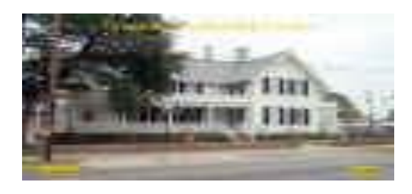
(Gressette Welcome Center)